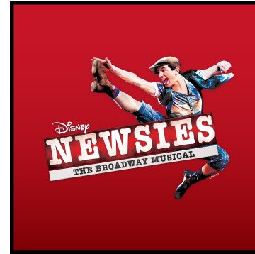
NEWSIES July 10 - 27