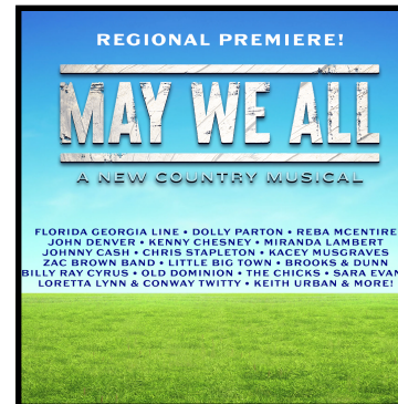
MAY WE ALL September 18 - October 5