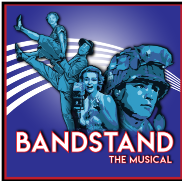
BANDSTAND August 14 - 31